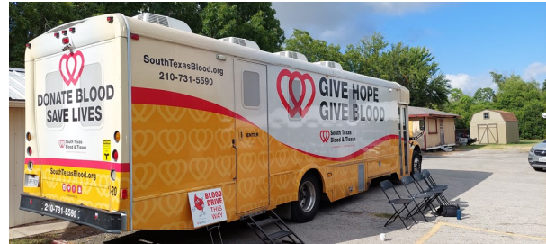
Saturday Morning Breakfast and Blood Drive