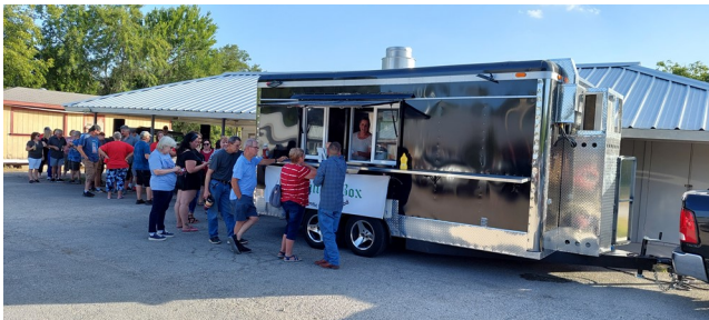
German Food Truck (This picture taken at 7:00 p.m., what a line!)