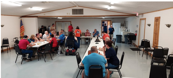
Tuesday Morning Coffee and Doughnuts with a side of Health Screening