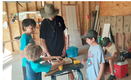
Troop 593 hosting Pack Field Day, Leather Craft Station