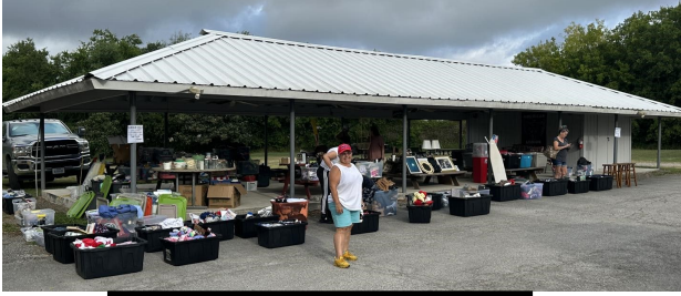
SAL. Rummage Sale