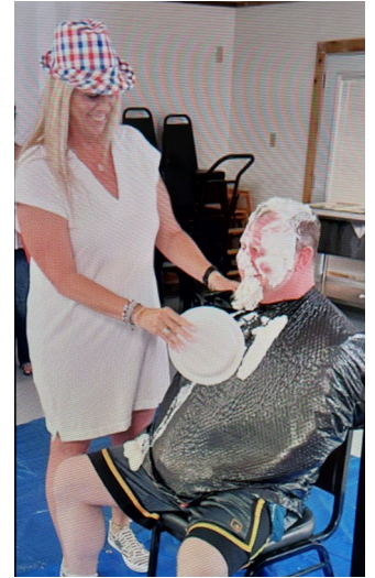
Informal Installation of Officers