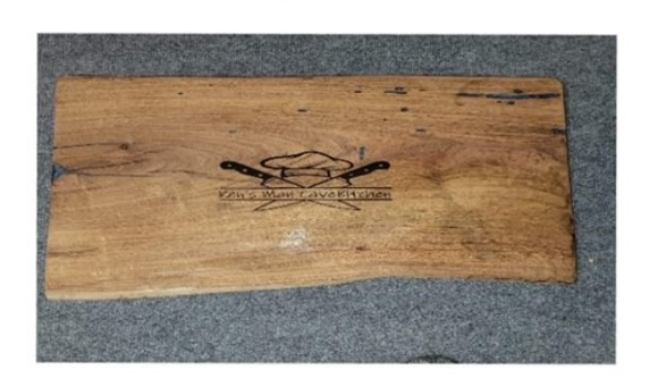
CUSTOM HANDMADE CUTTING BOARD BY HANNAH TAYLOR POST 593