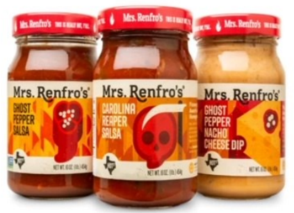
FORT WORTH, TX