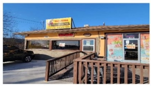
707 S SEGUIN, CONVERSE