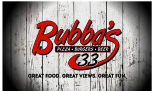
3136 PAT BOOKER, UC