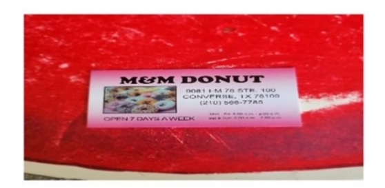
9081 FM 78, CONVERSE