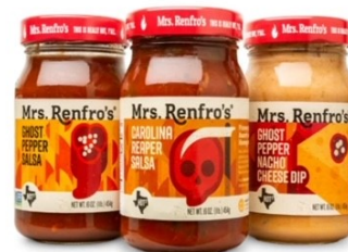
FORT WORTH, TX