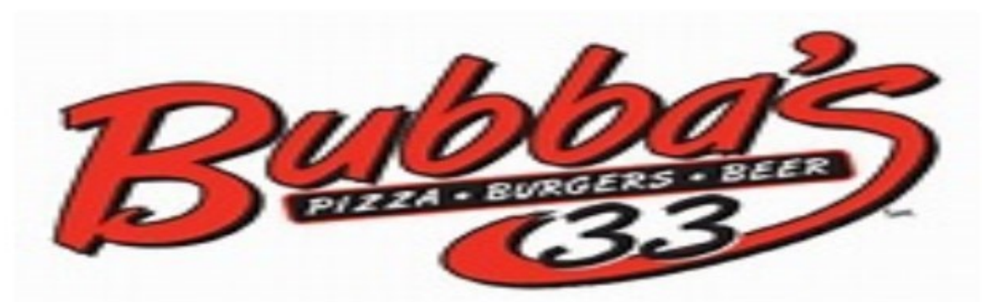
3136 Pat Booker Road, Universal City, TX

On June 14th from 4:00pm to 8:00pm, Bubba's 33 is hosting American Legion Post 593 Appreciation Night They are going to donate a percentage of their sales from American Legion Members to Post 593 during this time frame. All you need to do is to tell your server that you are an American Legion customer when you PLACE YOUR ORDER during this time