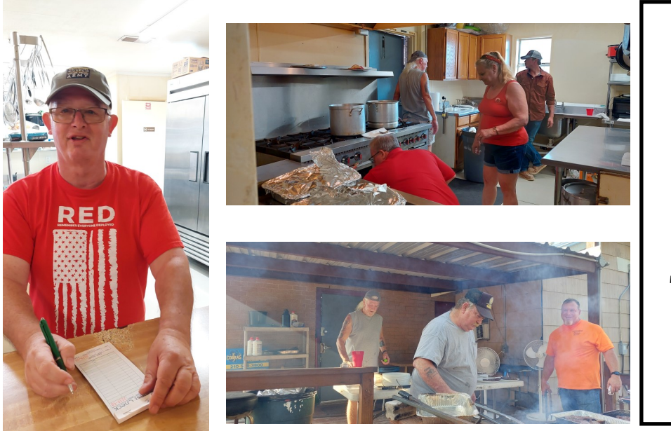
Great Steak Night Team!

Have a great month, see all of you later.