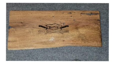
CUSTOM HANDMADE CUTTING BOARD BY HANNAH TAYLOR POST 593