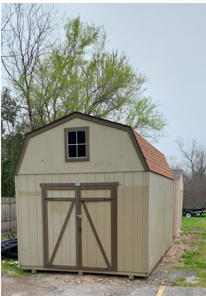
American Legion Auxiliary Unit 593

Shedding some light on our new storage improvements