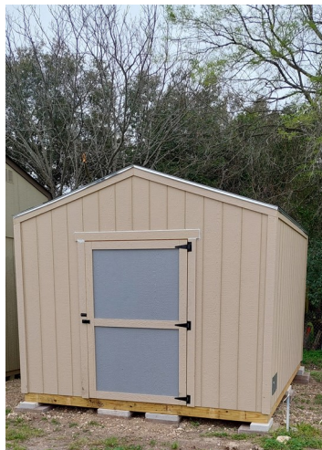
American Legion Riders 593