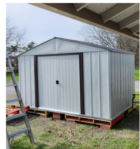
American Legion Boy Scout Troop 593