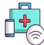
Comprehensive Primary Care

Engagement with peers and providers with veteran specific training