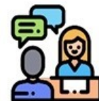
Social Service Integration

Multi-disciplinary homecare teams with a focus on patients with multiple comorbidities