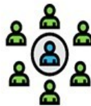
Veteran Centric Activation

Engagement with peers and providers with veteran specific training