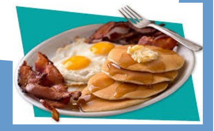
To-Go orders available. Open to the public.