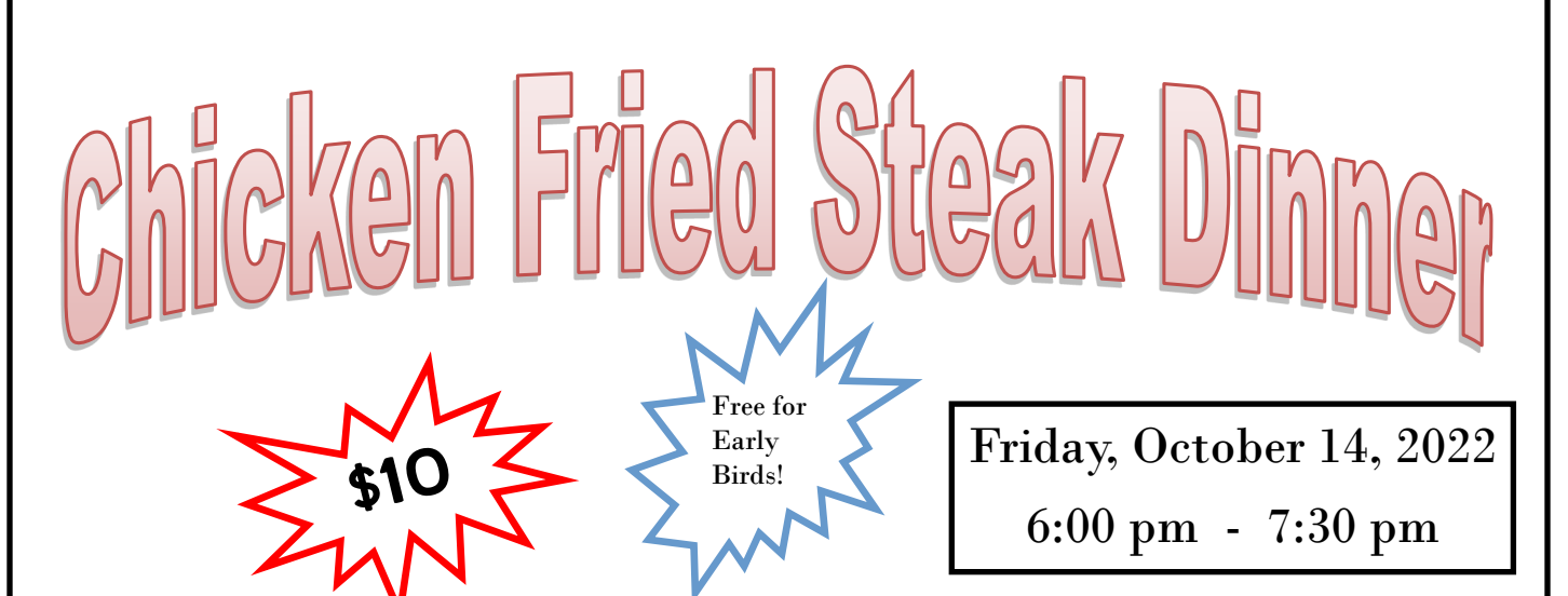
Hand breaded chicken fried steak, mashed potatoes, gravy, choice of vegetable, and dinner roll.