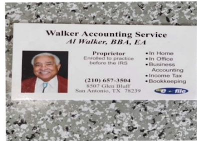
POST 593 MEMBER