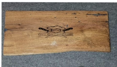
CUSTOM HANDMADE CUTTING BOARD BY HANNAH TAYLOR POST 593