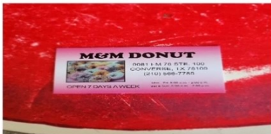
9081 FM 78, CONVERSE