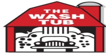
7535 FM 78