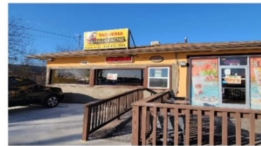
707 S SEGUIN, CONVERSE