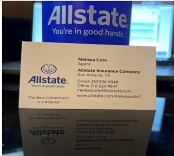
POST 593 MEMBER