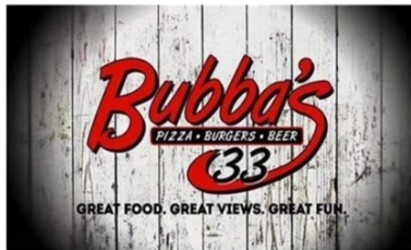
3136 PAT BOOKER, UC