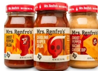
FORT WORTH, TX